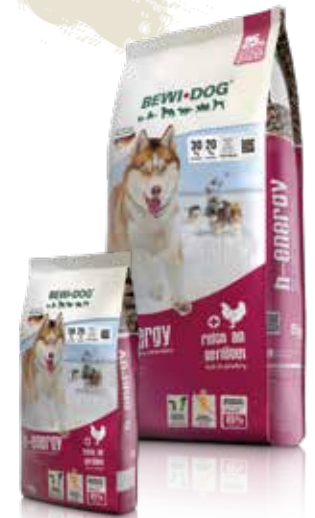
h-energy 800g, 25kg